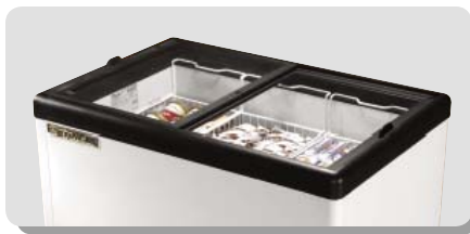
Shown with optional wire baskets.