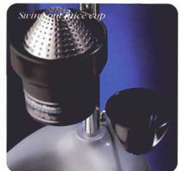
Swing-out juice cup