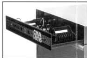
Convenient to service "Works-in-a-drawer", may be removed by unplugging one electrical connection.