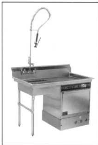
Optional dishtable, faucet and pre-rinse unit sold separately.