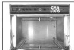
Upper and lower rotating wash arms guarantee excellent results.