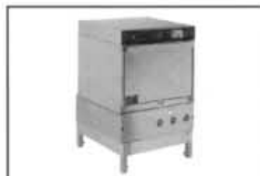
Optional pedestal allows the L-1X16 to be raised up to a full 12" off the floor for easy operator use. Height adjustable from 8" to 12".