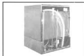
Pumped drain will drain uphill. Requires no floor drain.