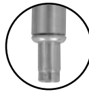
Stainless Steel Bullet Feet standard on SLAG & FLAG Series