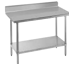
FLAG & SFLAG Series - 1 1/2" Backsplash