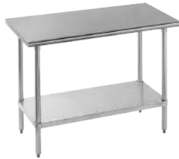
SLAG Series - Flat Top