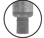
Plastic Bullet Feet standard on ELAG, FLAG & KLAG Series