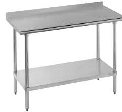
KLAG - 5" Backsplash